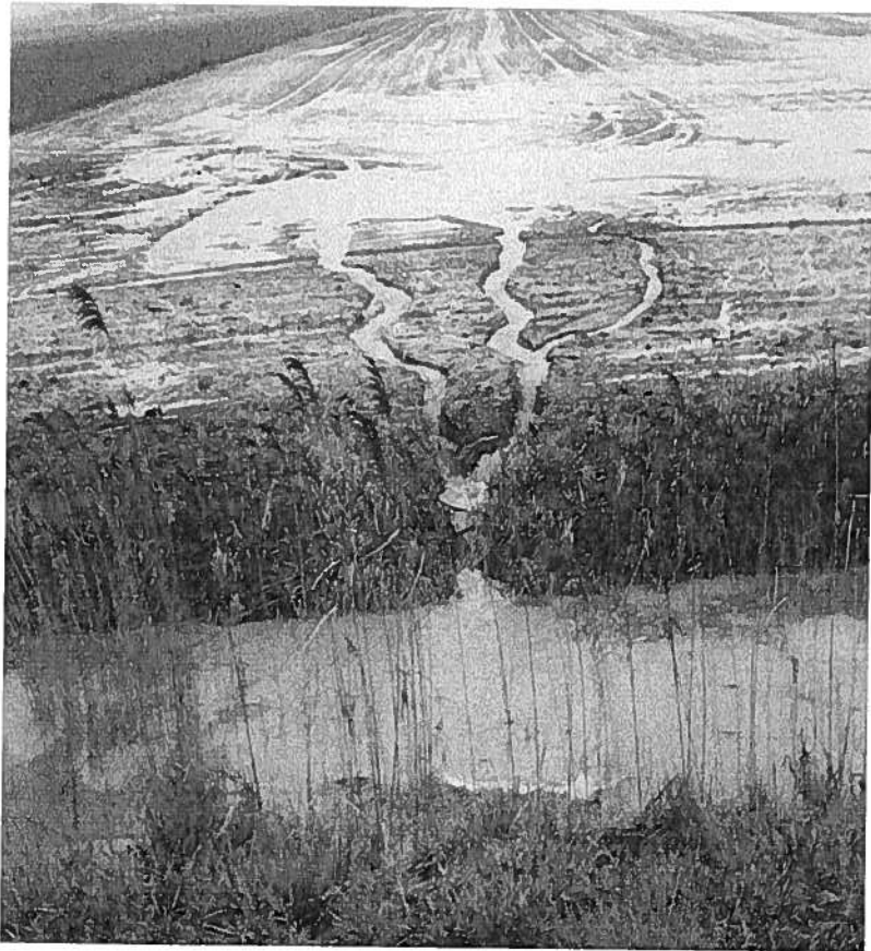
Picture of Drain with no buffer strips