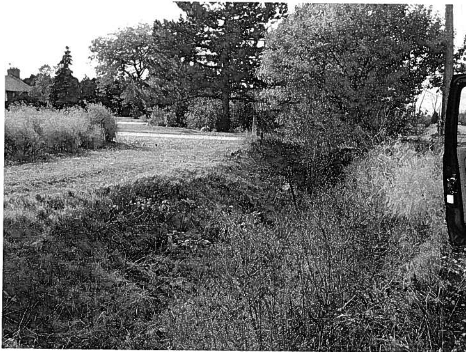
Picture of Drain with Buffer Strips