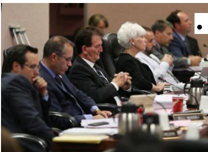
Windsor City Council meeting on August 24, 2015 August 24, 2015.