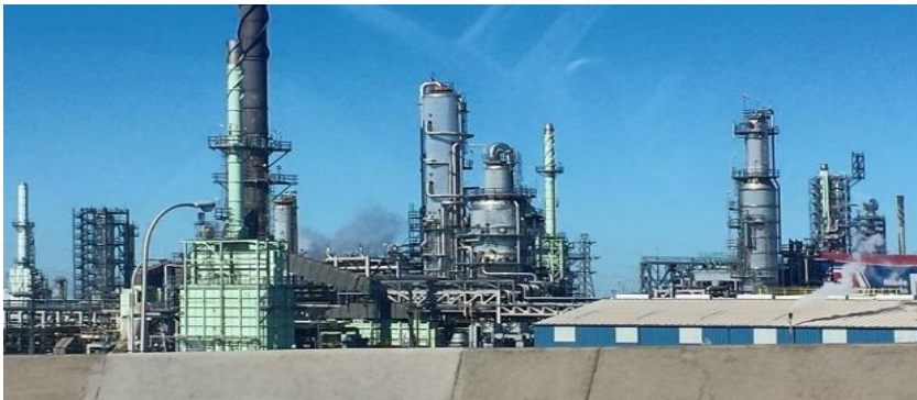
The Marathon oil refinery is located in southwest Detroit, which is 6.5 kilometres inland from LaSalle, Ont.

CBC News Posted: Jan 30, 2016 1:42 PM ET Last Updated: Jan 30, 2016 4:19 PM ET